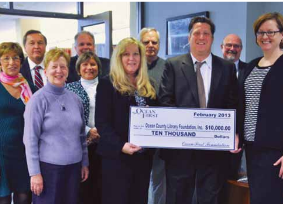
Left photo: The Ocean County Library Foundation marked its 13th year working on various partnerships and programs for the betterment of the Ocean County Library. The Foundation is a tax exempt organization established in 2001 to enhance the services and opportunities offered to all Ocean County Library users. Ten members of the community serve on the Foundation Board.