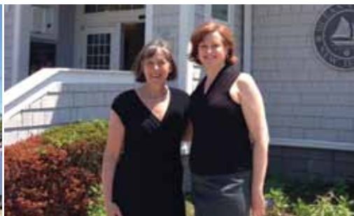
Left photo: The Upper Shores Branch of the Ocean County Library officially reopened to the public during a special ceremony held in September.