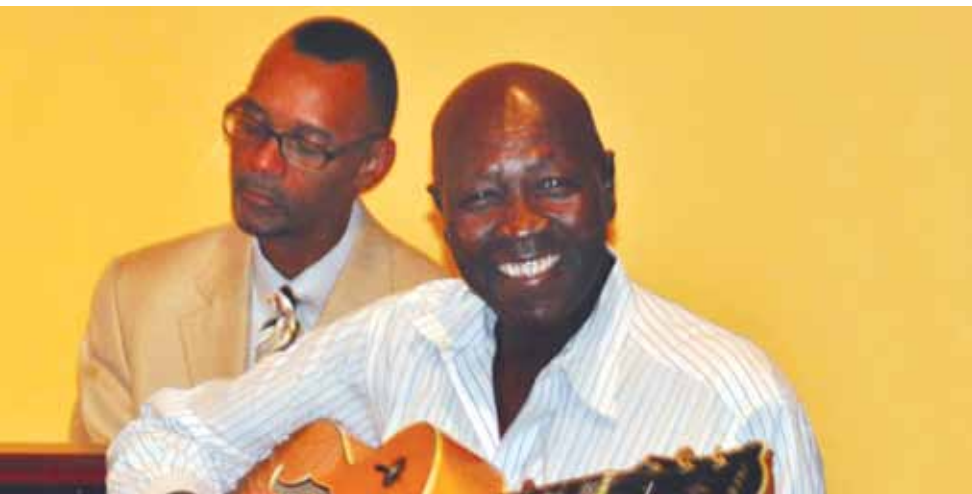
Left photo: The Toms River Branch of the Ocean County Library celebrated Gospel Music Month in September with Gospelfest 2013. A special concert was held at Mancini Hall on Sept. 28 that featured many local singers and dancers.

Office of the Governor of New Jersey Parents of Autistic Children (POAC) Pharmacy Department at Kimball Medical Center Pine Shores Art Association Pinelands Photography Group Plumsted Youth for Nature Point Pleasant Beach Chamber of Commerce Popcorn Park Zoo Ridgeway Elementary School Robin Hood Foundation Rutgers University Rutgers University School of Communication and Information School for Children with Hidden Intelligence SCORE Simon's Kitchen Southern Regional Adult School ESL Southern Regional High School St. Francis Community Center St. Peter's School Toms River Branch of the N.A.A.C.P. Toms River Business Improvement District Toms River School District USAopoly Women's Business Center Youth Services Commission