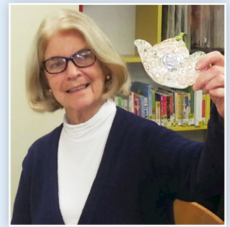
The Friends of the Island Heights Bran held a Victorian Tea Fundraiser on Saturday, January 3, 2015 in support of the Downton Abbey Friends event.