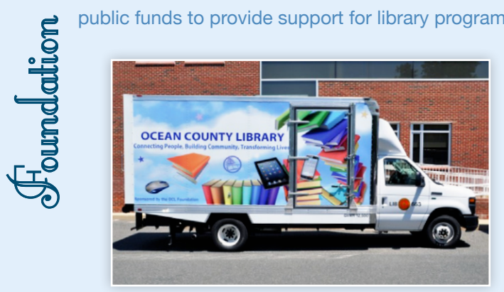
New graphics for the Ocean County Library delivery trucks were provided by the Ocean County Library Foundation.