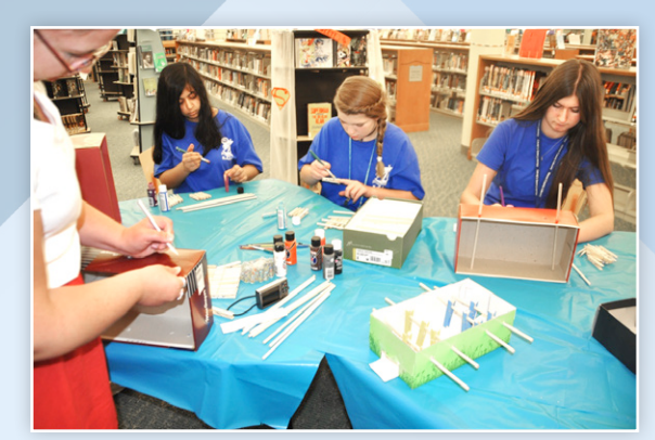
Our teens enjoyed being part of NJ Makers Day.