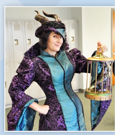
Many costumed characters visited the 1st annual FanNation: The Geekstrav