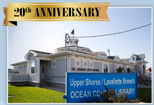
Our Upper Shores Branch celebrated its 20th anniversary.