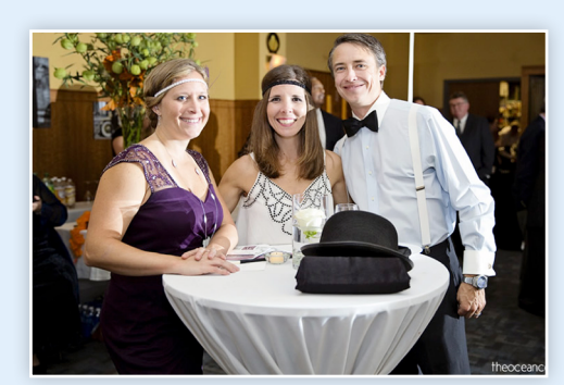
The Ocean County Library Foundation sponsored The Great Gatsby Gala celebrating our 90<sup>th</sup> anniversary.