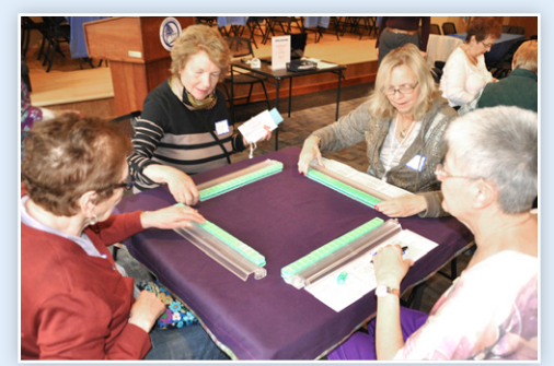
The Friend's annual Mah Jongg fundraising tournament.