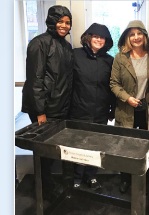
A little rain doesn't bother the Ocean County Library Homebound & Volunteer Services staff. They loaded a van in preparation for their outreach to five life care centers in Whiting.