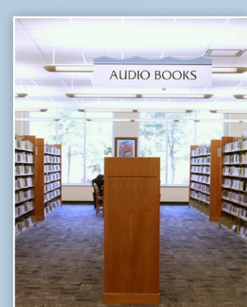
The Toms River Branch welcomed new carpeting to the whole branch.