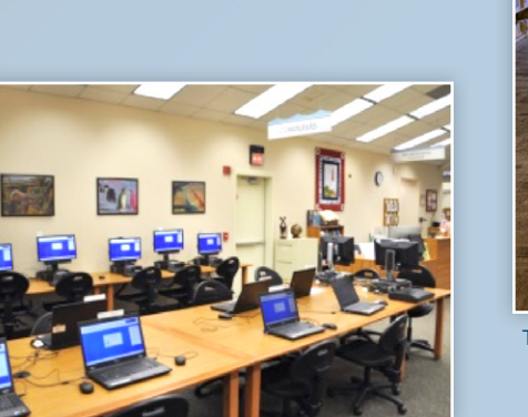
The interior of the Little Egg Harbor branch was refurbished with new carpeting, bookshelves, furniture, and technology.