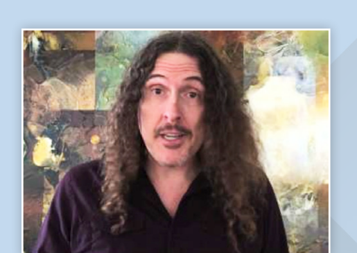
Weird Al Yankovic shared a special birthday announcement to celebrate the Ocean County Library's 90th anniversary.